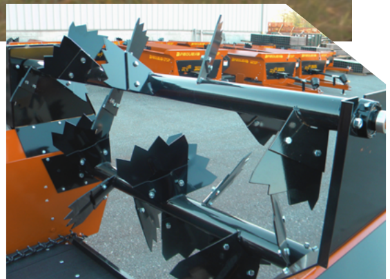
The 175P model has 10 removable beater paddles