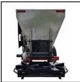
52" Overall Width