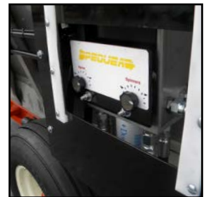
High Performance Manifold Block