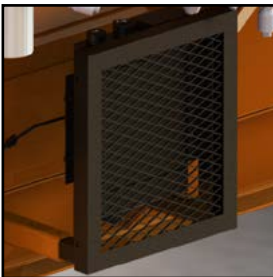
Oil Cooler (Optional)