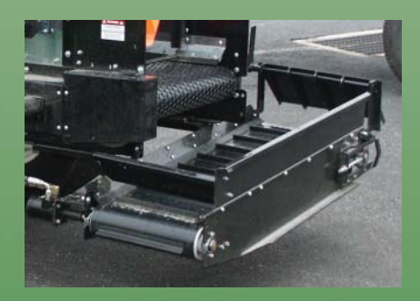
Mulch beds and sand traps can be filled with control and ease using the optional conveyor off-loader.