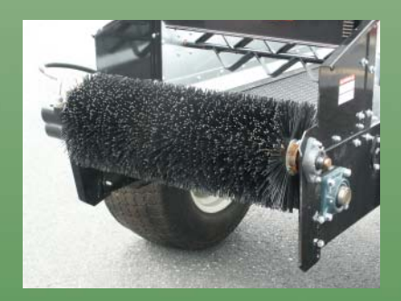
The optional brush allows for precise application of fine spread material.