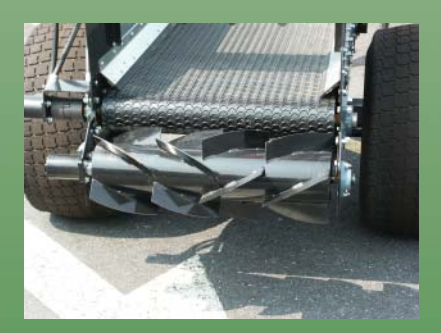
The optional beater can be used for numerous special applications.