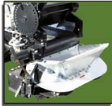
Adjustable 15° tilt spinners allow for a 15' wide heavy, penetrating spread or a 30' swath of accurate coverage.