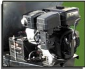
Standard 9 HP engine with electric start.