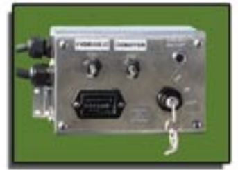
Standard in vehicle mount controls with independent conveyor and spinner shut off